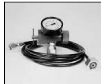
30731 Complete Filling and Gauging Assembly (Optional)